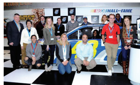
The 2018 Master of Sports Leadership Winter Institute class at the NASCAR Hall of Fame